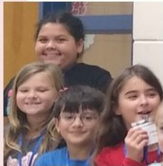
Clement Good News Club

On April 27 we will celebrate the work of God in the lives of children here in Sandhills area! With great joy we will also dedicate our new office space for the purpose of reaching every one of the 121,702 children in the Sandhills area. We hope every volunteer, sponsor, and community supporter will join us on this special day to pray fervently, honor the Lord, celebrate the victories he has given, and look forward with vision to the future.