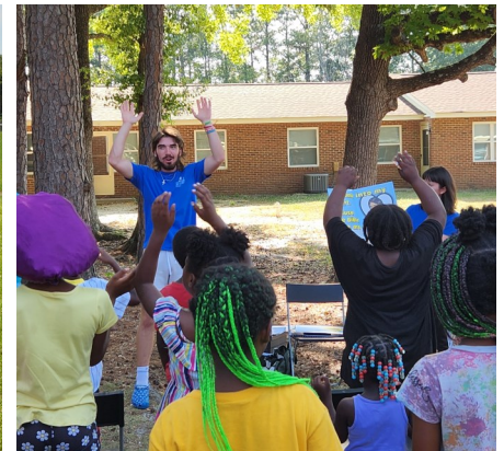
Thirty children heard the Good News at a neighborhood in Dunn last week.