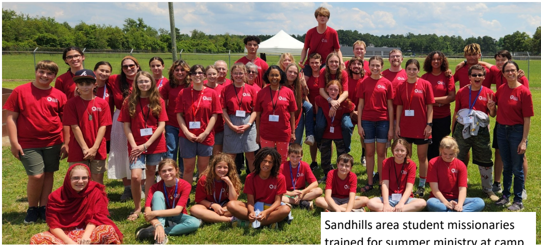
Sandhills area student missionaries trained for summer ministry at camp.

In July, CYIA ® students completed rigorous training and led 37 clubs. Over 550 children heard clear Gospel presentations in the first week of 5-Day Clubs ®. The well-trained, student missionaries were thorough in their presentations to ensure that each child clearly understood the Gospel. Trained Good News Club volunteers and previous CYIA missionaries heard of the need for more laborers and stepped up to help. Then, the Holy Spirit used their preparation and dedication! Twenty children decided to receive and follow Jesus as their Lord last week! This is God's work! Each of the CYIA missionaries worked approximately 7-8 hours each day to tell children of the Good News we have in Christ Jesus. Other volunteers sacrificed their time to drive missionaries, host clubs, and prepare meals. After our first week of ministry (two more weeks to come) we fell to our knees once again to recognize all that God had provided and accomplished! He is faithful!!