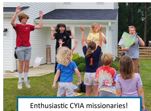
Enthusiastic CYIA missionaries!

to receive Jesus Christ as Savior, Lord, and King. We give God all the praise for the children seen and unseen whose lives are being changed by God through GNC’s, the Spectacular and