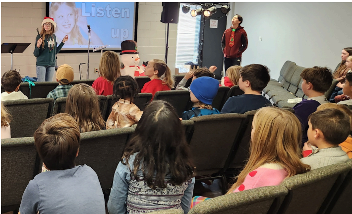
Christmas Party Club held at a local homeschool co-op

Party Clubs are evangelistic Bible clubs that are held during major holidays. Usually, these are in areas that have had little gospel outreach. This year 24 clubs were held and 426 children were reached with the Good News. 5 responded to join the family of God!