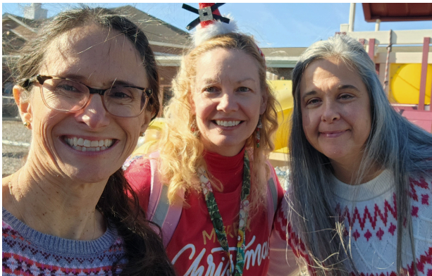
Christmas Party Club helpers