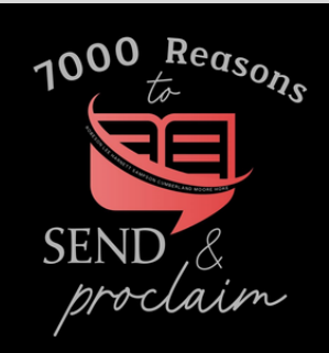
3. Plan to attend and give at: