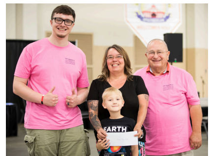
With 2024 prize winners